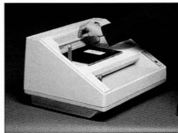
Third, set the machine to bind and lower the pressure bar.