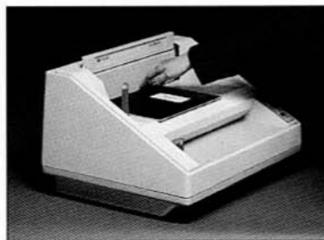
Second, add covers and strip and align document on bind surface.