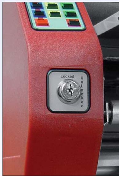
Key Switch Prevents Unauthorized Users