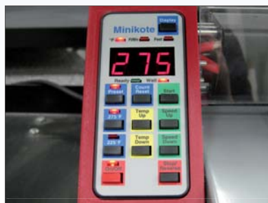
Touch Pad Controls