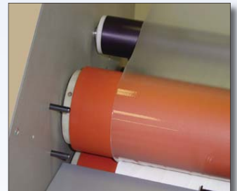
Dual Heated Silicone Rollers