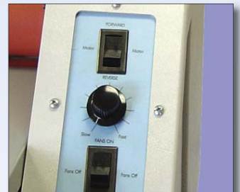
Speed Control & FWD/REV