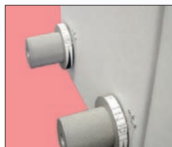
Nip & Pull Roller Adjustment