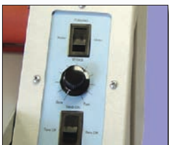
Speed Control & FWD/REV