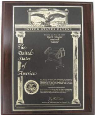
Patent Information US D544,893 S Laminator